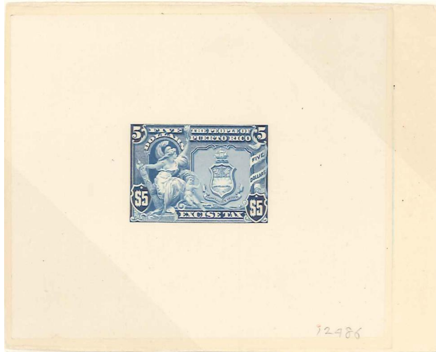
D23TC1 $5 large die on India paper