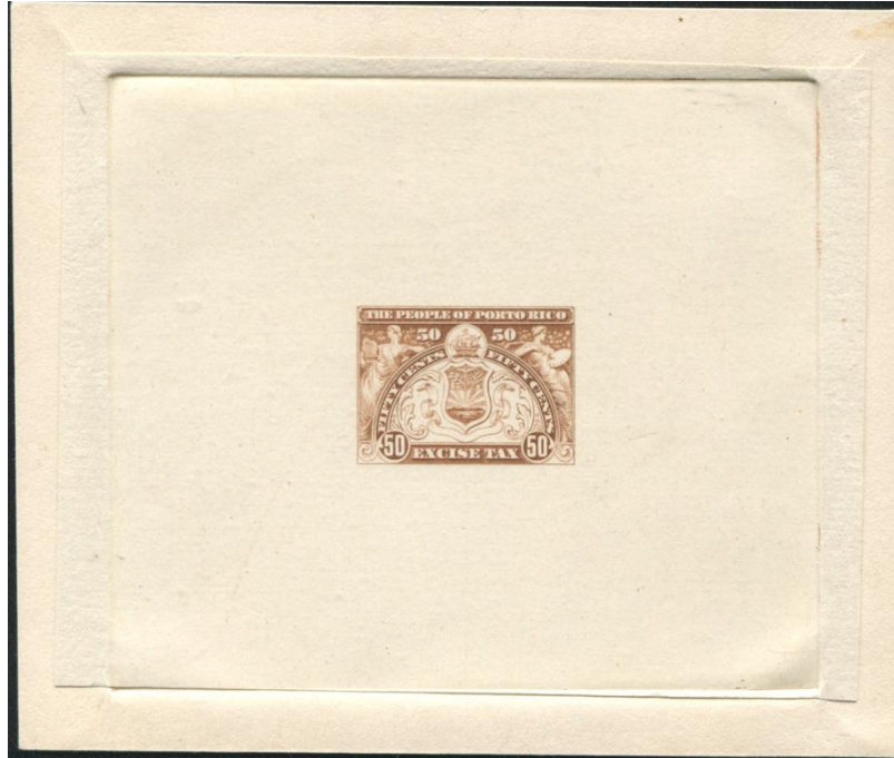
a. yellow brown