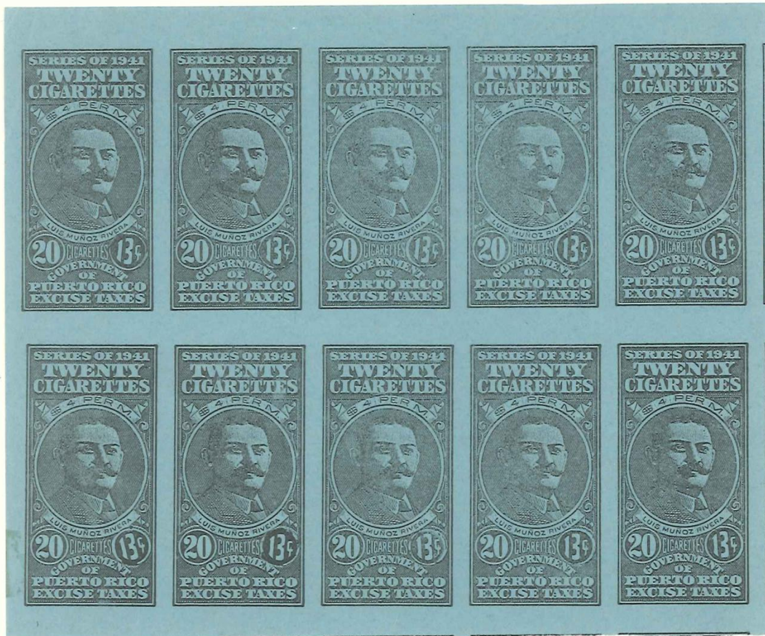
XXXP3 13c 20 Cigarettes black on blue paper