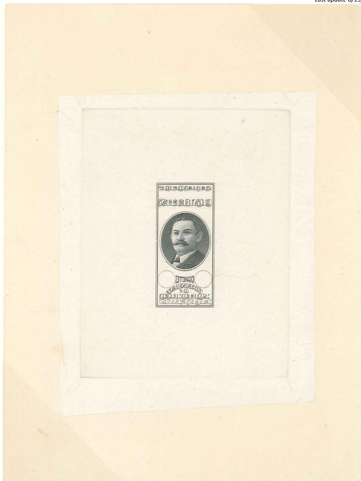
XXX-E1 Drawing on white card, black