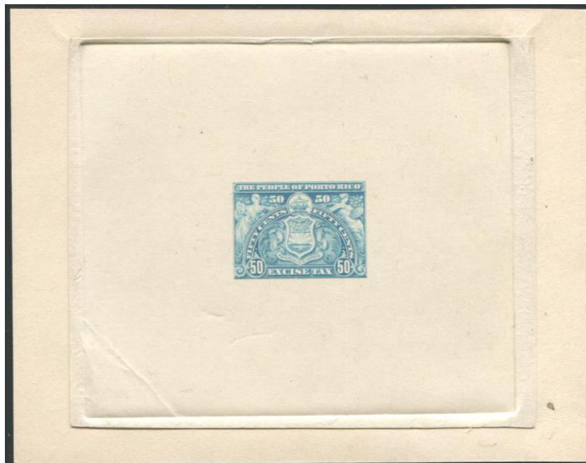
b. blue green