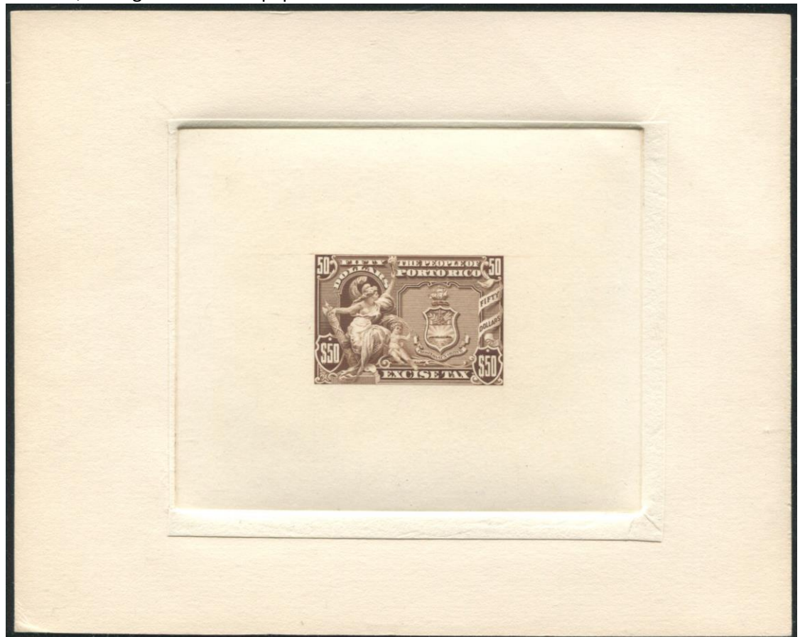
D25TC1 $50 large die on India paper