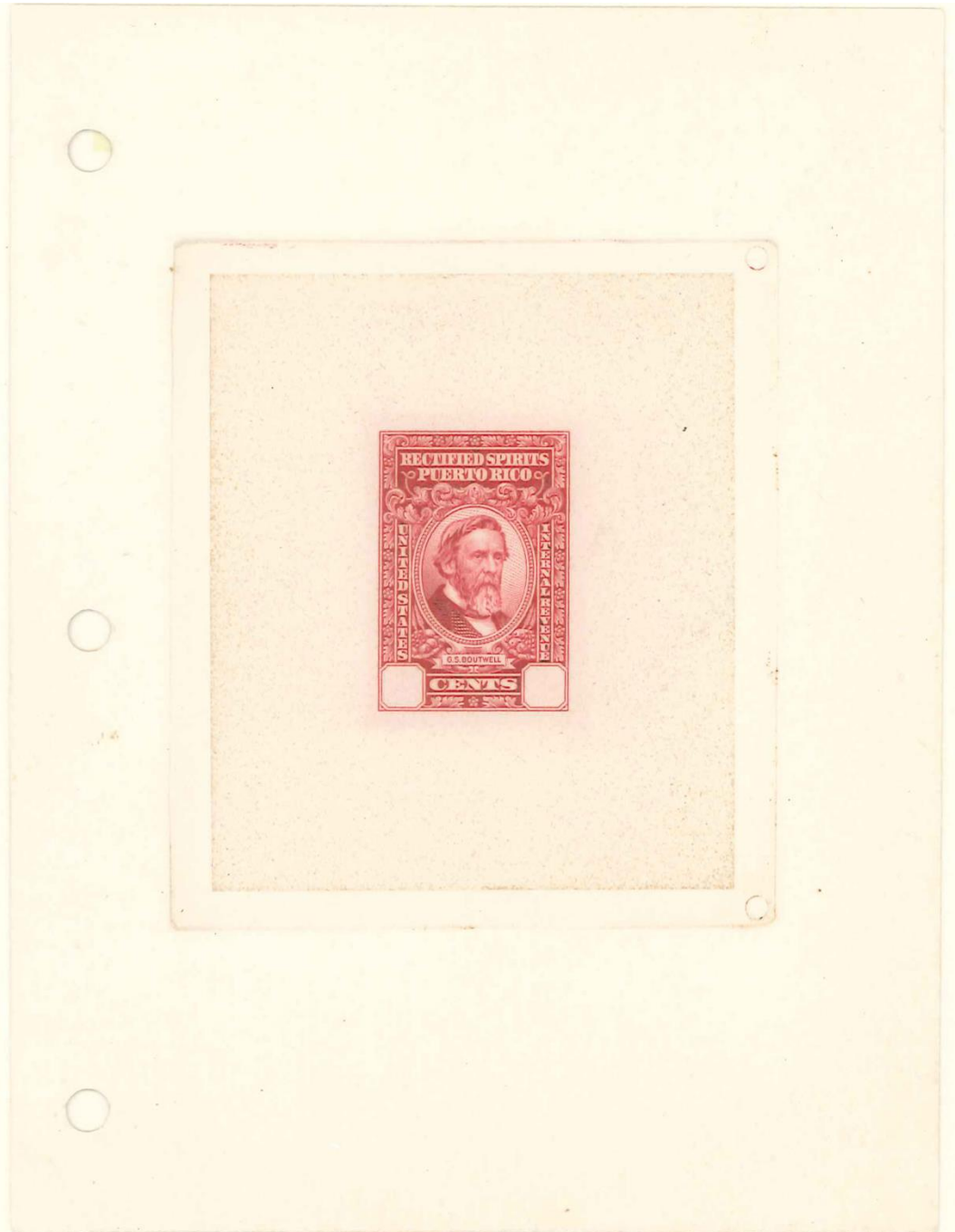
XXX-E1 Blank, die on India, die sunk on card, red