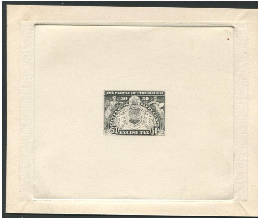
c. olive slate