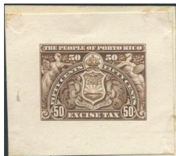
a. dark brown