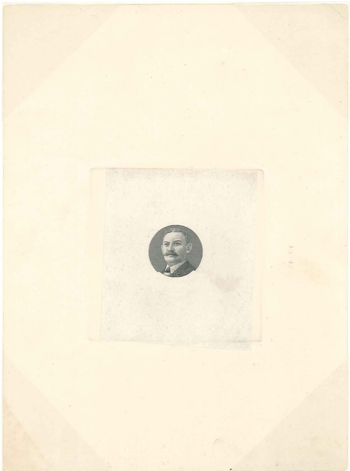
XXX-E1 Vignette, die on India, die sunk on card, black